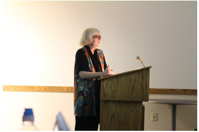
The group seems to be enjoying the program.