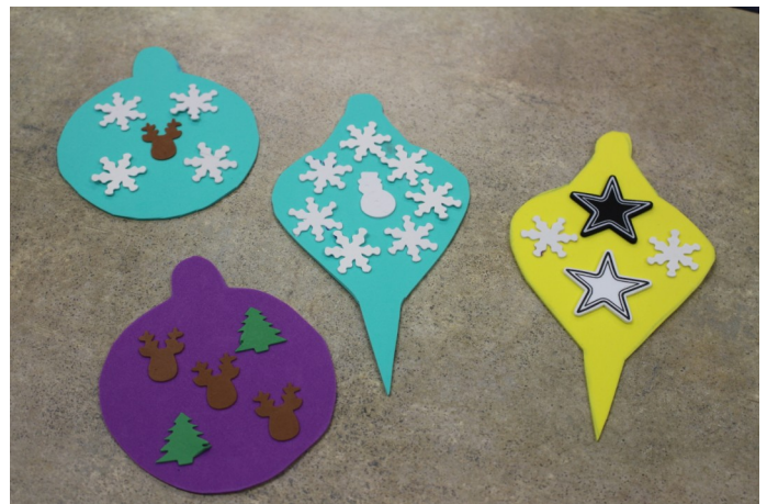
Some of the results - aren't we a talented bunch?!