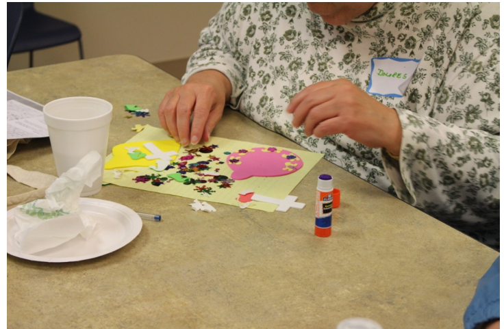
Blank ornaments and decorations to choose from.